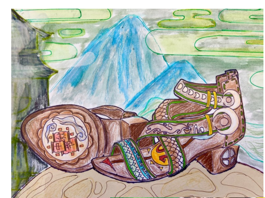
The arts enable us to have experiences we can have from no other source.

The arts' position in the school curriculum symbolizes to the young what adults believe is important.